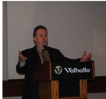
Hon. Michael Gravelle, Minister of North- ern Development and Mines