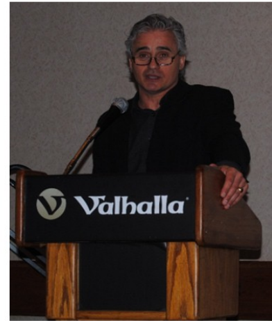
Hon. Bill Mauro, Minister of Natural Resources and Forestry